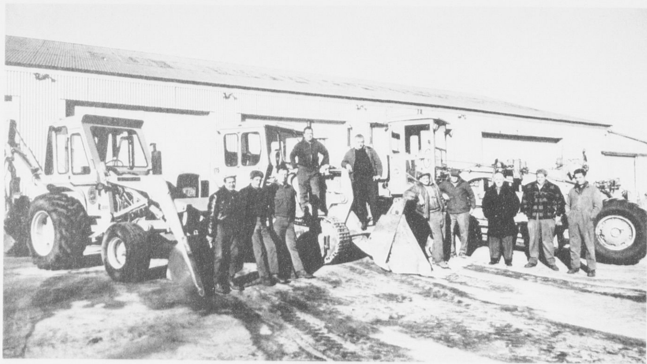
This Report is Dedicated to the Men of the Westport Highway Department